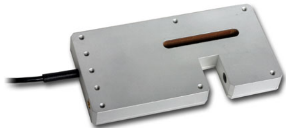
J-compensated surrounding coil JRF (flat)