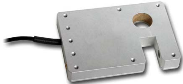
J-compensated surrounding coil JRR (round)