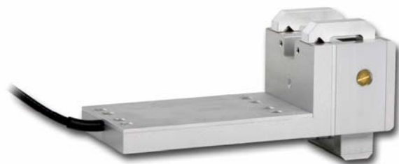
Potential coil PS-R-40/58

The coil consists of a C-shaped yoke of laminated soft steel with two pole faces of each 25 mm x 25 mm with an average distance of 50 mm. It is equipped with a system of exciting and measuring windings. The exciting winding is connected to the power supply, the measuring winding to a fluxmeter.