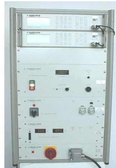
Cabinet of the PERMAGRAPH® – REMAGRAPH® – COMBINATION C – 750 (with optional temperature control TC 3)

You can find a detailed description of all features of the PERMAGRAPH® C and of the optional accessories in the specification of this instrument.