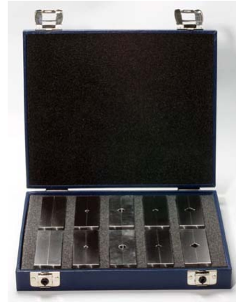
Exchangeable pole pieces